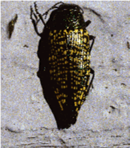
Figure 2: Metallic wood borer.

rarely tunnel extensively enough to cause structural failure. Adult borers found inside the home may look ominous and pinch the skin if handled but are not dangerous.